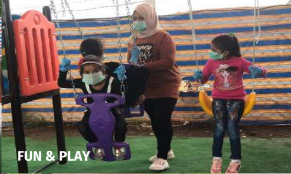
FUN & PLAY