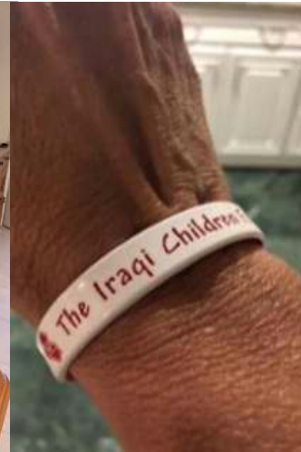
TEEBA: ICF AWARENESS-RAISING WRISTBANDS