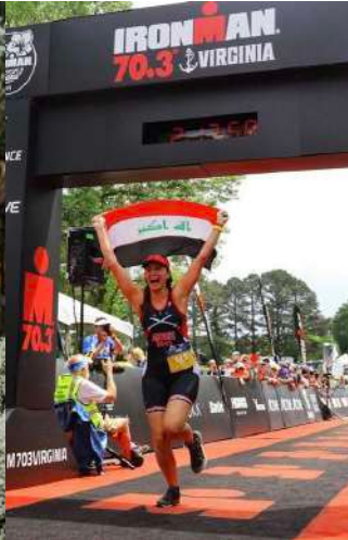
MAIS: FUNDRAISING THROUGH A FULL IRON(WO)MAN