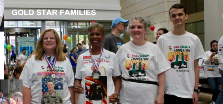
GOLD STAR FAMILIES