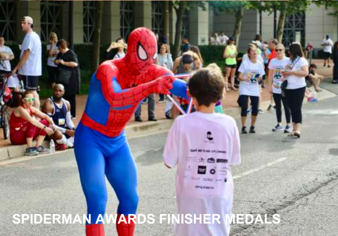
SPIDERMAN AWARDS FINISHER MEDALS