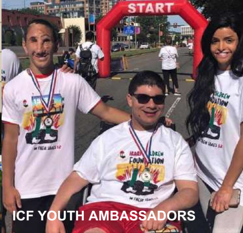
ICF YOUTH AMBASSADORS