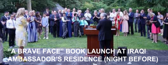
"A BRAVE FACE" BOOK LAUNCH AT IRAQI AMBASSADOR'S RESIDENCE (NIGHT BEFORE)