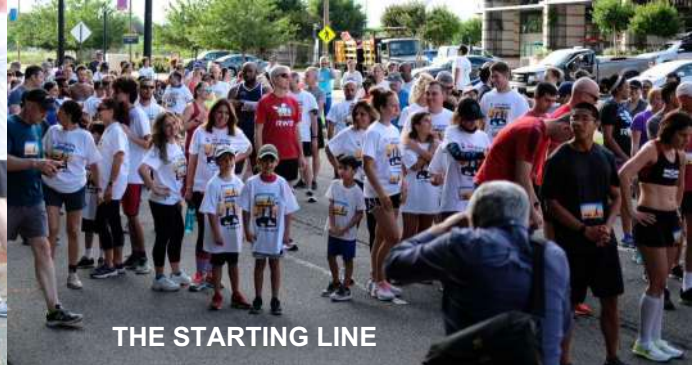
THE STARTING LINE