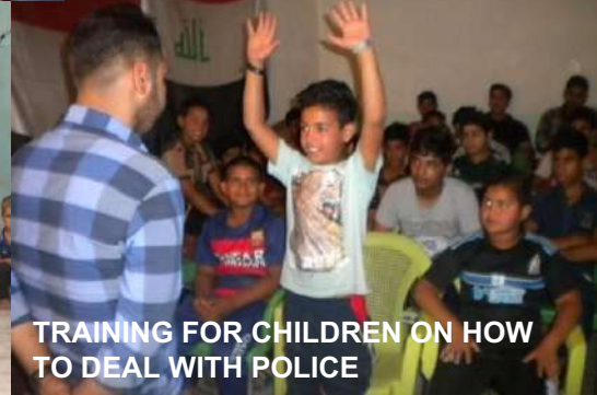
TRAINING FOR CHILDREN ON HOW TO DEAL WITH POLICE