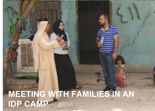
MEETING WITH FAMILIES IN AN IDP CAMP