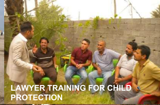
LAWYER TRAINING FOR CHILD PROTECTION