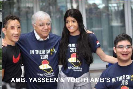
AMB. YASSEEN & YOUTH AMB'S