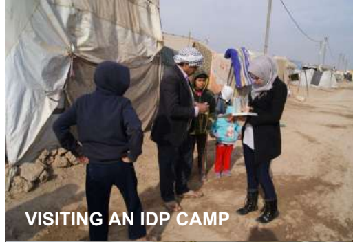
VISITING AN IDP CAMP