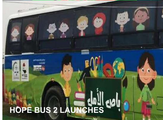
HOPE BUS 2 LAUNCHES