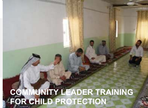
COMMUNITY LEADER TRAINING FOR CHILD PROTECTION