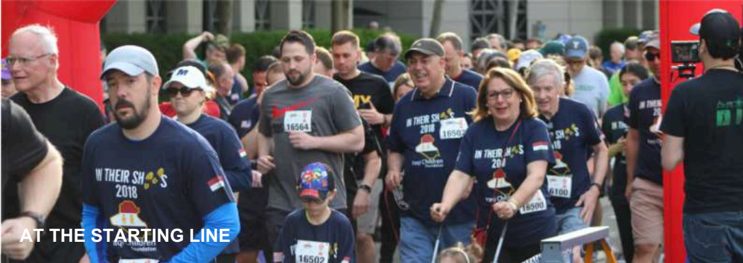
AT THE STARTING LINE