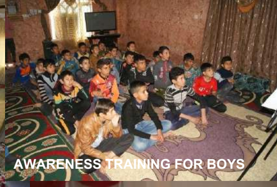
AWARENESS TRAINING FOR BOYS